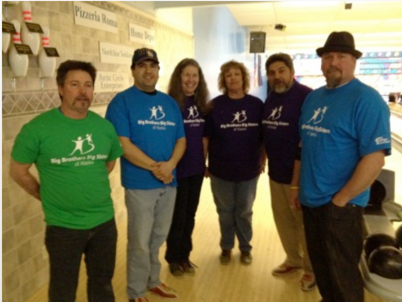
Kensington Bowling Bear team at the Bowl for Kids' Sake annual fundraiser