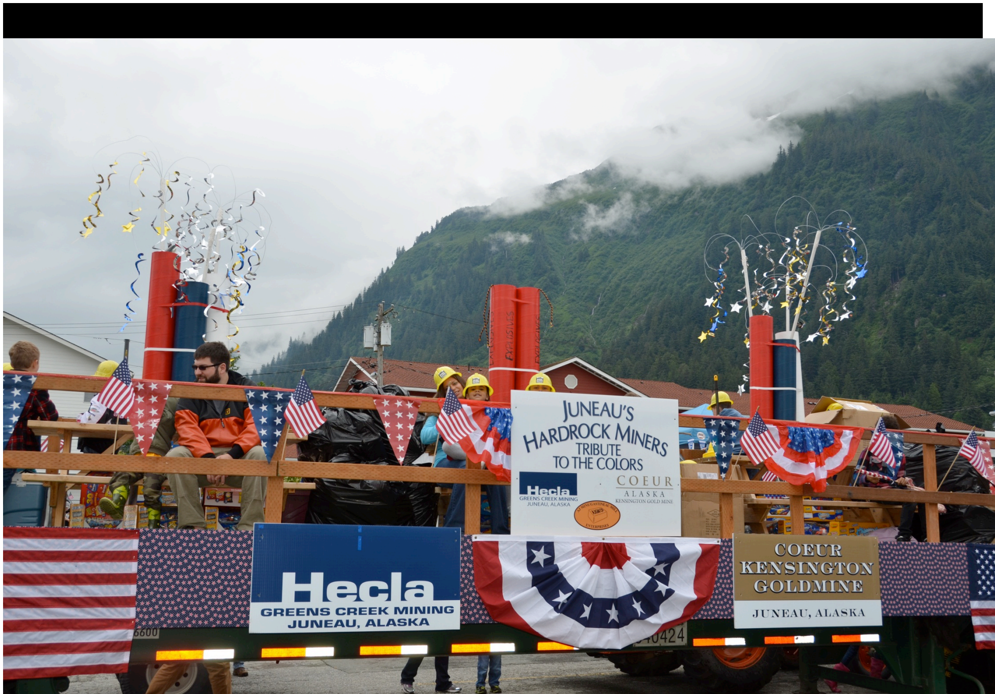
4 th of July 2012