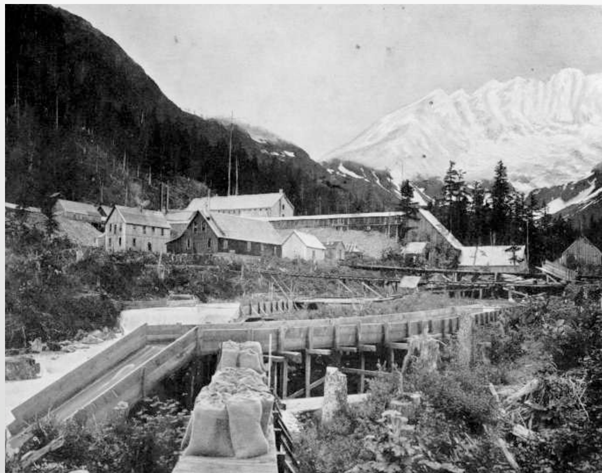
Jualin Mill & Lions Head Mountain (ca. 1918) – Facing NW