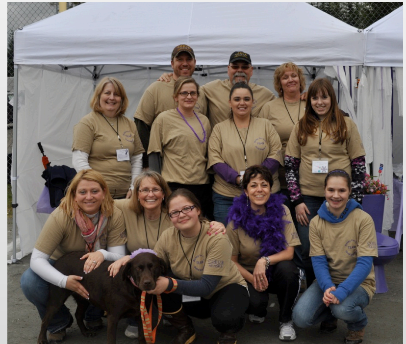
The Gold Diggers Coeur Alaska Relay For Life Team