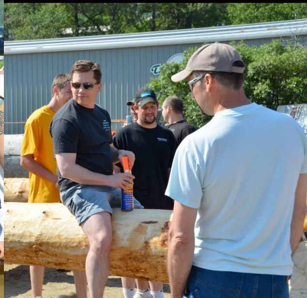
Gold Rush Days 2012